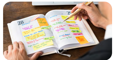
All on your schedule

Call or go online to activate your free program.