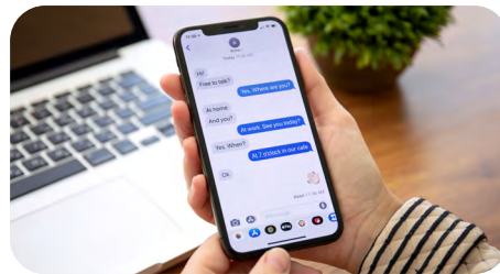
Reminders & encouragement